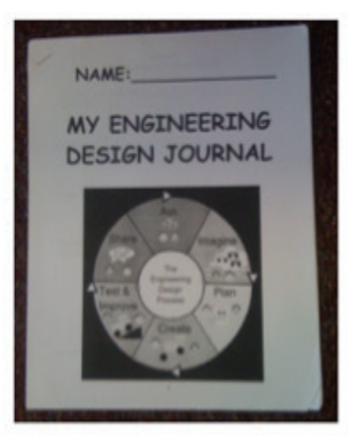
Figure 5: Engineering Design Journal

In addition to these engineering concepts, each lesson integrated foundational concepts of math, literacy, and the arts. For example, throughout the week, children used Engineering Design Journals (Figure 5) to plan, design, and refine their robotic constructions and programs. By using these journals, children were engaged in a combination of writing, dictating, and drawing. Children also grappled with math concepts of shapes, counting, and sequencing while building and programming their robots. Students exercised their creativity in designing their robots and creating displays using arts, crafts, and recyclable materials. Finally, songs and music were used to teach the steps of the engineering design process (see Appendix.) and the parts of a robot. The song was also performed during the Open House.