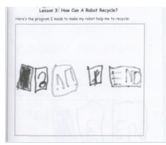
Figure 6: Sample Design Journal Page from a Pre-K Student

Observational data from researchers as well as the Pre-Kindergarten classroom teachers indicate that the robotics week curriculum engaged participating students in math and literacy in a variety of ways. All three of the Pre-Kindergarten teachers cited the design journals as a successful tool for integrating and practicing foundational literacy concepts during robotics time. In a post-survey, one teacher explained, "The children used a combination of drawing and beginning writing to describe their experiences in their robotics journal." Figure 6 is an example of how a Pre-Kindergarten child used a combination of drawing and early writing in their Engineering Design Journal to document the programming blocks needed to help their robot "recycle"