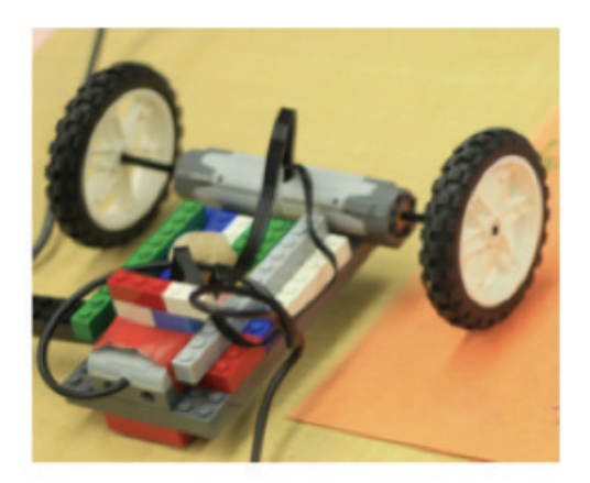
Figure 3: Child-Made LEGO® WeDO™ Robot

Once a robot is built, a tangible program can be uploaded to it by placing the program in the web camera's field of view and connecting the robot