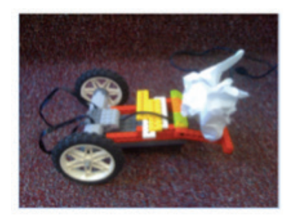
Figure 4: Sample Robot Recycler

The robotics curriculum involved approximately 10 hours of intensive work over the course of 5 days (approximately 2 hours per day). Implementation of this curriculum coincided with the school's "Robotics Week," an intensive weeklong experience where all classes are immersed in robotics, computer programming, and engineering. Prior to this week, the Pre-Kindergarten students completed an introductory unit on tools. Throughout this unit, children became familiar with to concept of tools and investigated the use of common tools around the house, garden, and school. The robotics curriculum was designed to serve as the culmination to this unit on tools. Students spent the week focused on tools that can assist with the recycling process. Children designed these tools by engaging in the engineering design process, built them using the robotic kits, and programmed their behaviors using the programming language associated with the kit. After developing proficiency in several core areas of engineering, robotics, and computer pro-