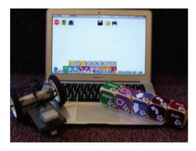
Figure 1: CHERP Computer Programming Software

to create both physical/tangible and graphical/on-screen programs to control their robots (Bers & Horn, 2010). Children can create physical programs using interlocking wooden blocks or onscreen programs using the same icons that represent actions for a robot to perform (Figure 1). Informed by the spirit of puzzles, there is no such thing as a syntax error. With CHERP, the shape of the interlocking blocks and icons creates a physical syntax that prevents the creation of invalid programs. CHERP programs can be compiled in a matter of seconds with the press of a button.