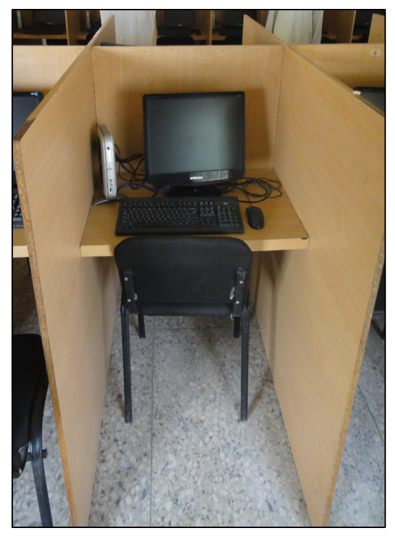
Figure 1: Candidate Workstation at FUT Minna.

The current e-examination process in FUT Minna is administered by the electronic Testing Company (eTC). The e-examination venue is a purposely-constructed building containing a campus server and an independent backup electricity supply linked to 120 thin client ("dumb") terminals, which issue multiple choice questions over an internal wired network. The student terminals do no processing, but transfer keystrokes to the server and display the server response on the screen. Questions from individual course lecturers are encrypted using his or her public RSA key (Rivest, Shamir, & Adleman, 1978) and sent directly to the eTC database pool from where they are uploaded onto the thin client terminals for candidates to answer. This e-examination security strengthens the reliability and efficiency of the system. Collusion and cheating is prevented within the dedicated building by the use of partitioned carrels and a video-surveillance system covering all candidates (Figure 1). Student identity is authenticated conventionally upon entry by using photo ID cards.