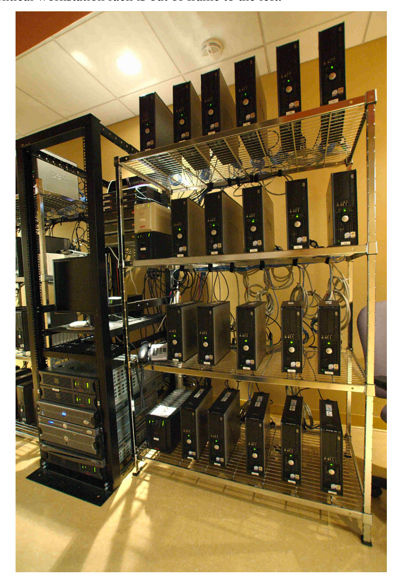
Figure 2. VLAB physical configuration.

2.) The left rack houses (top to bottom) network switches, KVM switches, shared I/O devices, SAN server, and SAN UPSs. The right rack houses half of the VLAB workstations and their UPSs. An identical workstation rack is out of frame to the left.